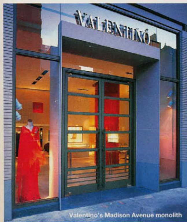
Valentino's Madison Avenue monolith