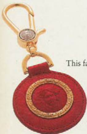
Versace keychain, $36

hasn't seen this much street glamour in a long time