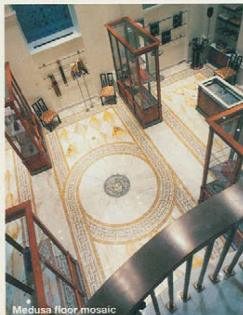
Medusa floor mosaic

647 Fifth Ave. (between 51st and 52nd); 212-317-0224 Versace's largest store is nestled in the last of the Vanderbilt townhouses that once populated Fifth Avenue; mille grazie , Gianni, for restoring this 90-year-old beauty, a New York City landmark. This style temple (designed by Laboratorio Associati) is the epitome of Versace opulence: The white-marble-and-limestone and Corinthian column façade encases five floors, connected by a marble staircase. Enter via a Milanese-made floor mosaic featuring Medusa's head, Versace's signature emblem, which shows up all over—on buttons, rhinestone cigarette lighters, and a 3-carat diamond-encrusted ring in the fine-jewelry salon. As for the clothes, go ahead and gawk: Why not, when there are $699 pony-skin ankle boots, a $23,000 bright green croco-