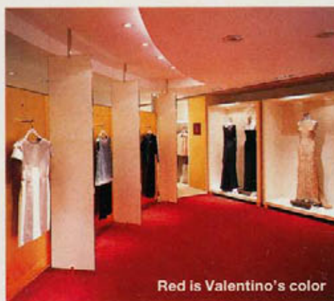
Red is Valentino's color

a little something: A woman's belt for $135 the big time: $13,000 Valentino Boutique crystal-bejeweled black, sheer halter gown