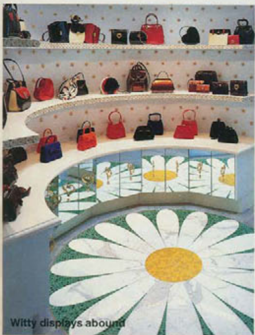
Witty displays abound

68th); 212-639-9600 We have a winner: the Most Fun Store of All, if you feel the need to lighten up in the midst of all that Madison Avenue reserve (did you notice all those ladies in little beige suits and spectator pumps walk-