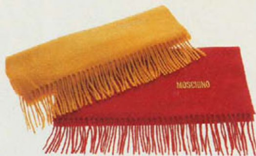
Signature scarves, $55

988-9191. Large and luxe—his biggest store yet—showcases every elite goodie from his