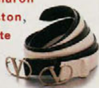
Valentino logo belt, $135

cool perks: Check out Vizione, his sportier line, available in the spring