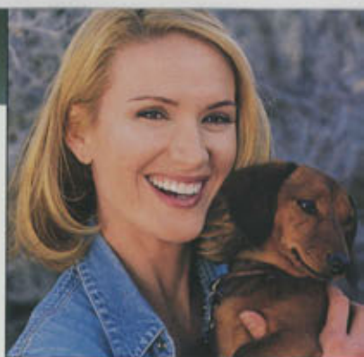
Kelly Lynch in Lone Pine